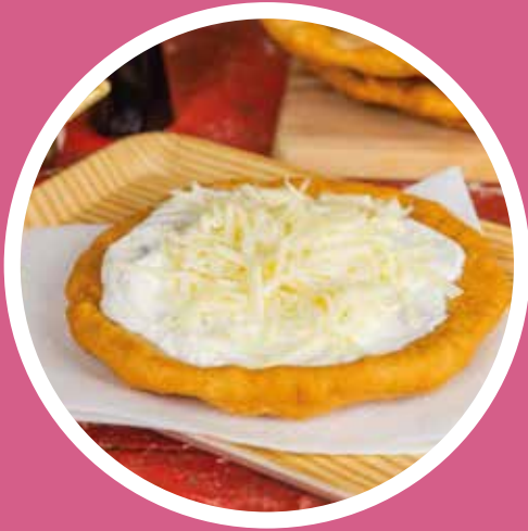
„Lángos” – dough with sour cream, garlic and cheese