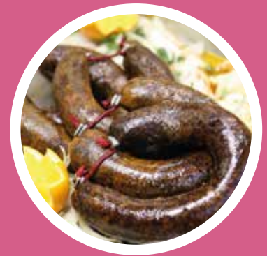
„Hurka” – made of pork