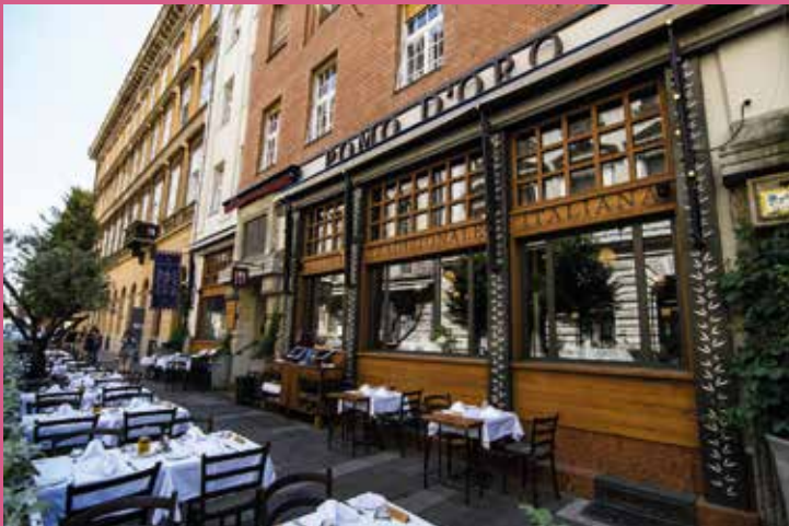
Trattoria Pomo D'Oro - Arany János utca 9.