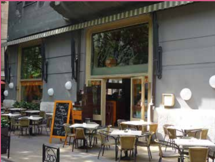
Menza - Liszt Ferenc tér 2.