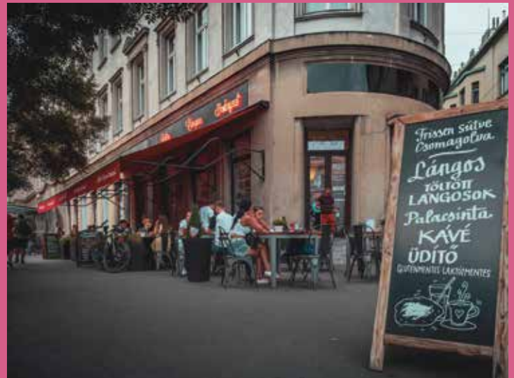
Retro Lángos - Bajcsy-Zsilinszky út 25.