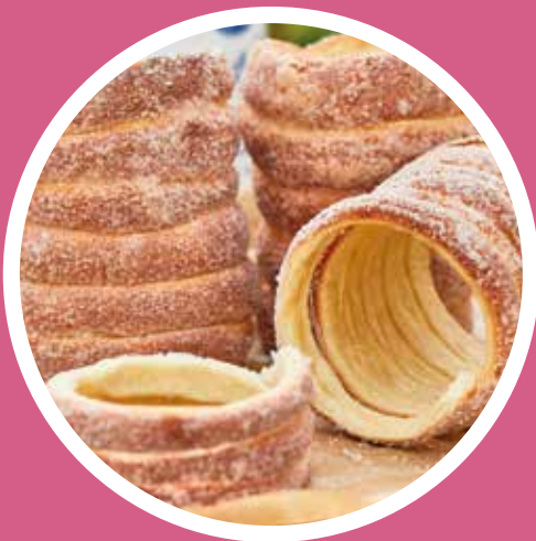
„Kürtös kalács” - a sweet, spiral-shaped pastry. It's also known as 'chimney cake'. You can have it in different flavours like: cinnamon, walnut, coconut, vanilia.

„Rétes” - similar to the Vienna Strudel, except it is a bit thinner. Rétes is a Hungarian peasantcake and is used to be a part of every celebration feast in the Hungarian lowlands.