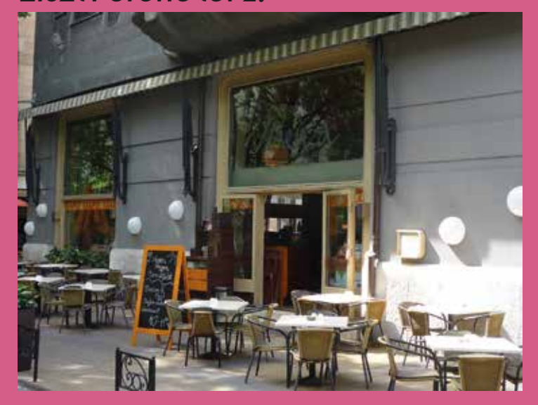
Retro Lángos - Bajcsy-Zsilinszky út 25.